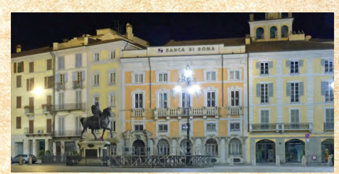
Plaza in Piacenza